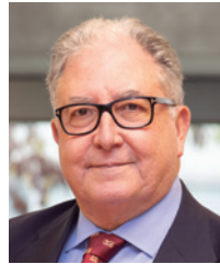
A. J. Torres García